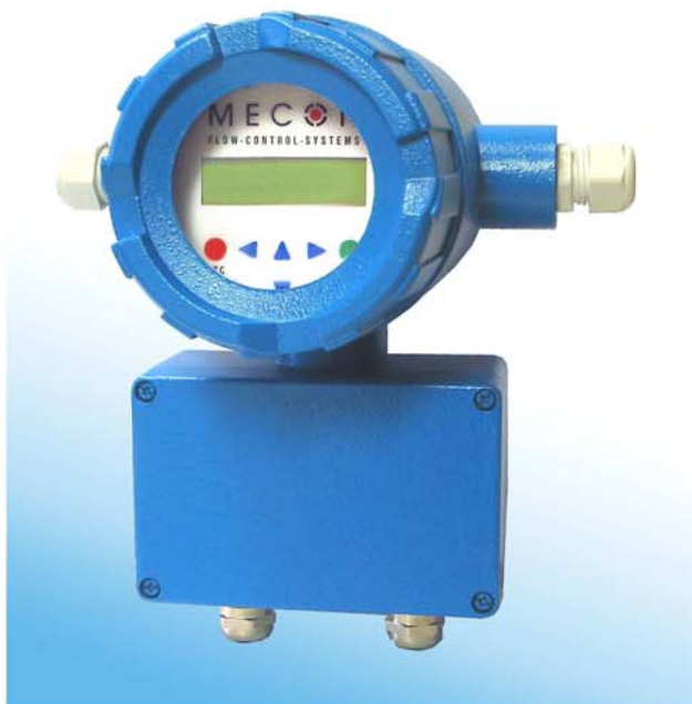
Fig 1 Magnetic inductive transmitter mag-flux M1 (remote version)