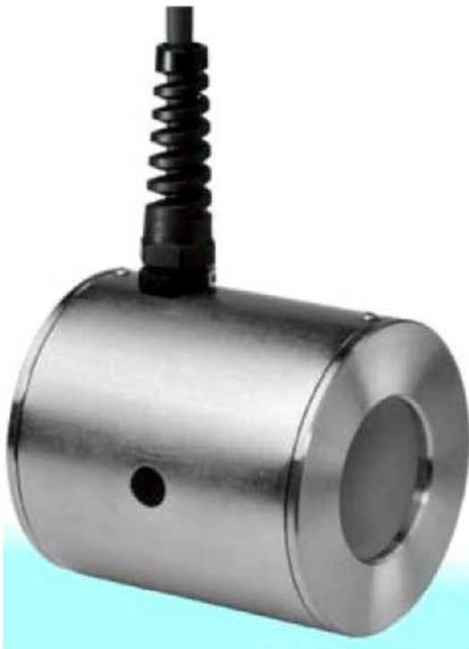
Fig. 1 Electromagnetic flow Sensor mag-flux S