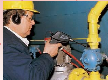
Ultraprobe 100 testing pump valve leaks

The Ultraprobe 100 features an 8-position sensitivity dial with decibel indications. In addition, it features an LED bar graph display in which each LED equals approximately 3 dB — ideal for calculating decibel levels.