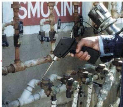
Tests steam traps