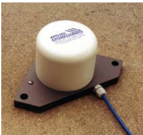
Model 711-2 (4X) Weatherproof Platform Tiltmeter

Each tiltmeter comes with a hookup cable and power supply for quick operation using your PC.