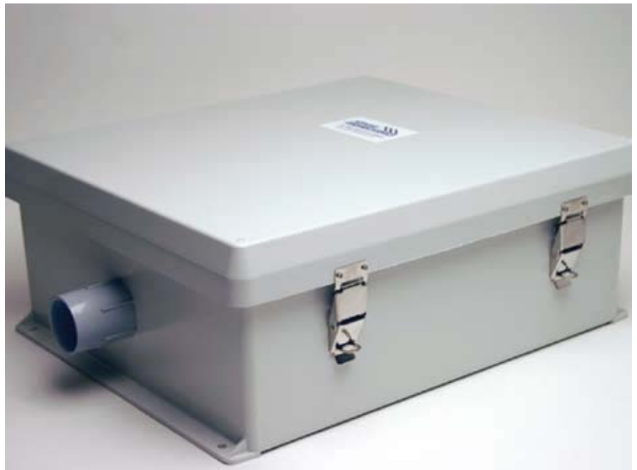
Model 798 Handi-Logger

Instruments and external multiplexers connect to your Handi-Logger via the clearly labeled internal wiring panel. Cell phone, modem, storage module and radio telemetry options are available for communication with your host computer. Six terminals are provided for activation of a wide range of alarm peripherals, including autodialers, horns and strobe lights.