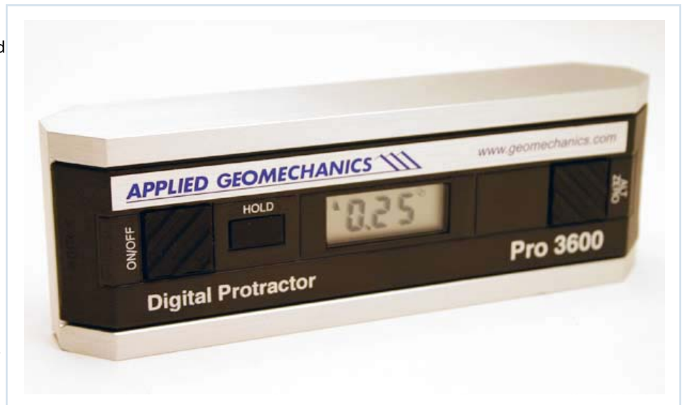
Pro 3600 Digital Protractor

at the top and bottom surfaces of the instrument. The top and bottom surfaces are parallel to within ±0.005 inch (±0.1mm). A V-groove runs the length of the bottom surface for easy placement on curved surfaces such as pipes or tubes. There are two threaded mounting holes in the bottom of the Pro 3600 for fastening to a mounting surface with screws.