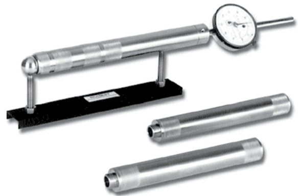
Model PF25 jointmeter and extensions

The PF25 consists of a steel tube with a fixed conical seat at one end and a spring-loaded conical seat, attached to a dial indicator, at the other end. To take measurements, the PF25 is located over two 25 mm stainless steel reference balls anchored to the structure.