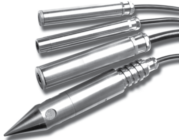
Models FOP, FOP-C, FOP-F and FOP-P

The FOP-P is designed to be driven into unconsolidated fine grain materials such as sand, silt or clay. The external housing is a thick-wall cylinder fitted with a conical shoe at one end and an EW drill rod or standpipe thread adapter at the cable entry end.