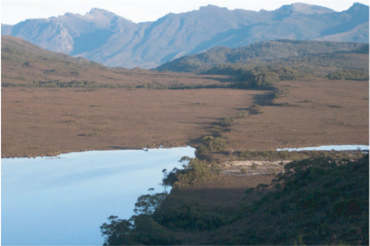
A major fault located adjacent to significant infrastructure in southeastern Australia