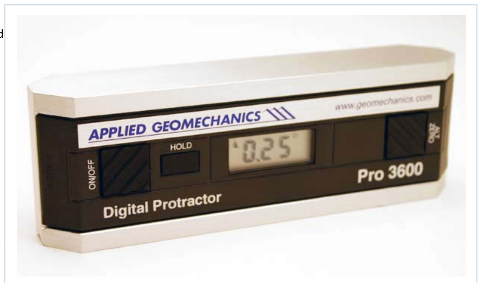
Pro 3600 Digital Protractor

at the top and bottom surfaces of the instrument. The top and bottom surfaces are parallel to within ±0.005 inch (±0.1mm). A V-groove runs the length of the bottom surface for easy placement on curved surfaces such as pipes or tubes. There are two threaded mounting holes in the bottom of the Pro 3600 for fastening to a mounting surface with screws.